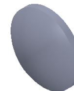
Isometric view 1:1