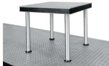
The example of use of silent rods