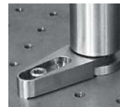
820-0125 clamp the rod exactly at the middle