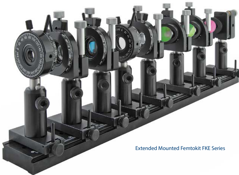
Extended Mounted Femtokit FKE Series