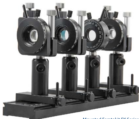
Mounted Femtokit FK Series

Non-standard kits with larger apertures of BBO crystals and thicknesses optimal for other pulse durations are available on request.