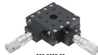
860-0092-02 with 870-0045-04 installed