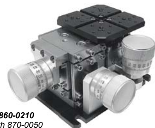
860-0210 with 870-0050 installed