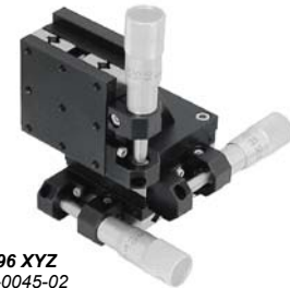
860-0096 XYZ with 870-0045-02 installed