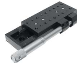
860-0060-06 with 870-0040-50 installed