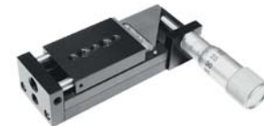
860-0058-20 with 870-0040-20 installed