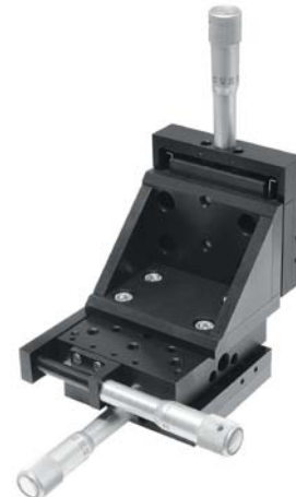
860-0053 XYZ with 870-0040-25 installed