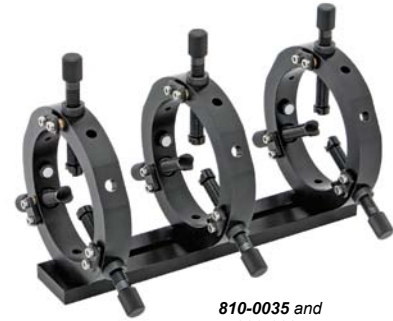
810-0035 and 830-0035