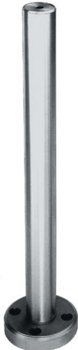
Large rod with rod base 810-0051