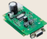
980-0040-USB see page 8.189