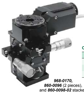
968-0170, 860-0096 (2 pieces), and 860-0098-02 stacked

Mini Motorized Rotation Stage with Vacuum compatible stepper motor 960-0170V is available. For product data sheet please visit www.eksmaoptics.com